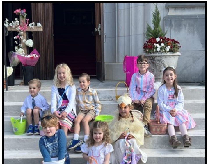
Easter Egg Hunt