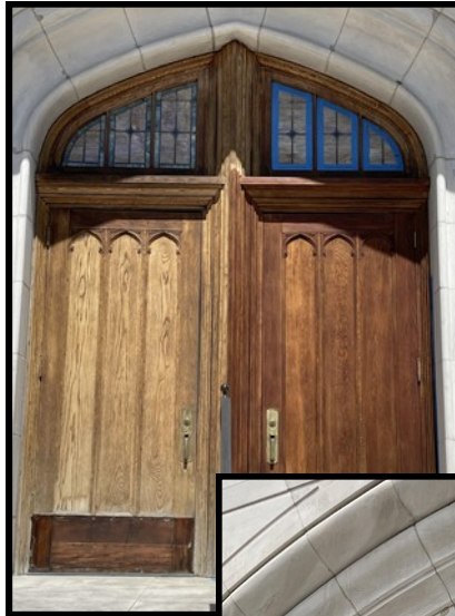
Front Door Transformation

Sun., Jul. 3, 4PM – Asheville Jazz Orchestra's Patriotic Concert!