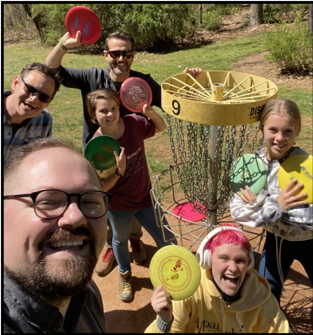
Youth Disc Golf Day