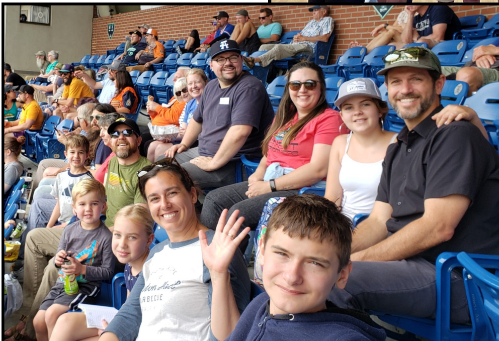
May Day Church Family Asheville Tourist Game