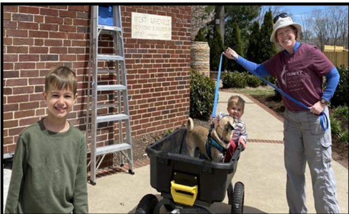
Spring Work Day